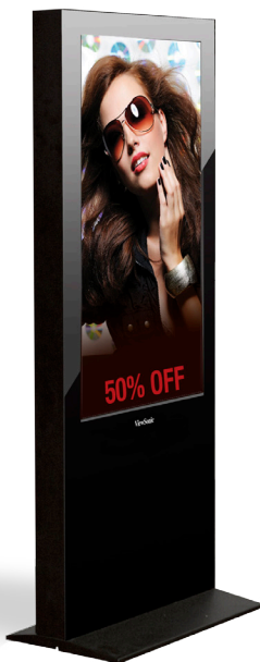
ViewSonic EP4602 e-Poster